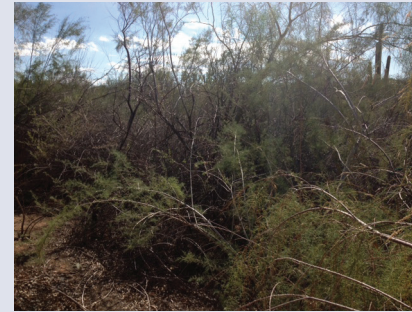
The above is an example of overgrown vegetation in its natural state and, per NAOS requirements, it cannot be removed unless its hazardous or blocking drainage.